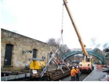
Construction of the new overall station roof utilising materials brought to site by rail

Due to the restricted vehicular access to the site it is proposed that the majority of the construction materials, plant etc. will be brought to site by rail from the NYMHRT's New Bridge Depot to the north of the site. This depot already has access for Heavy Goods Vehicles.