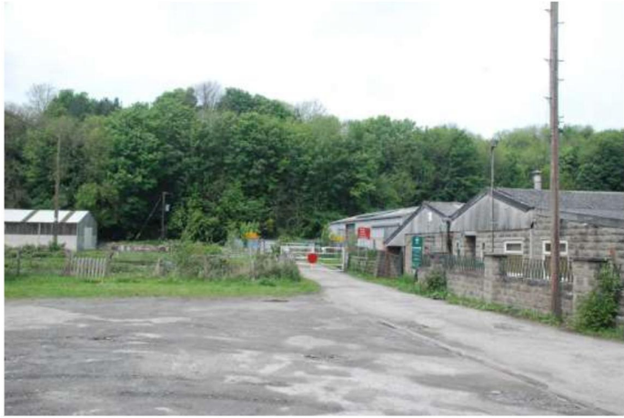
Level crossing with the car park on the left. View looking west.