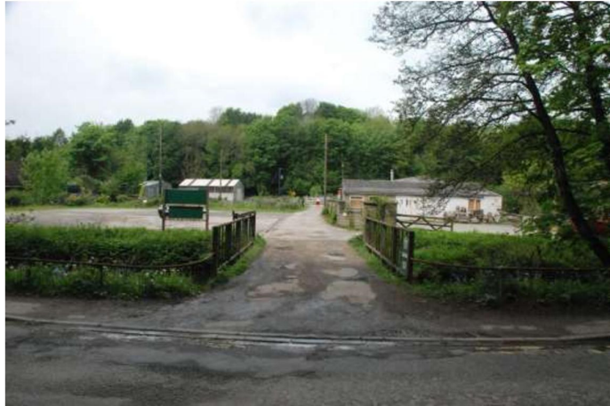
Site entrance and bridge over the beck.