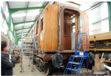
Internal view of the current LNER Carriage shop

The current facility, constructed during the 1980's, adjacent to the southern end of the station car park only has capacity to handle one long term carriage overhaul at a time. The net consequence of this capacity shortage is that the running fleet is steadily looking shabbier, and the backlog has grown to the extent that there are insufficient coaches to provide the ideal capacity without either leaving passengers standing in the aisles or loss of revenue having to turn passengers away. This leads to a loss of revenue and limits the growth potential of the NYMR and the tourism economy it supports.