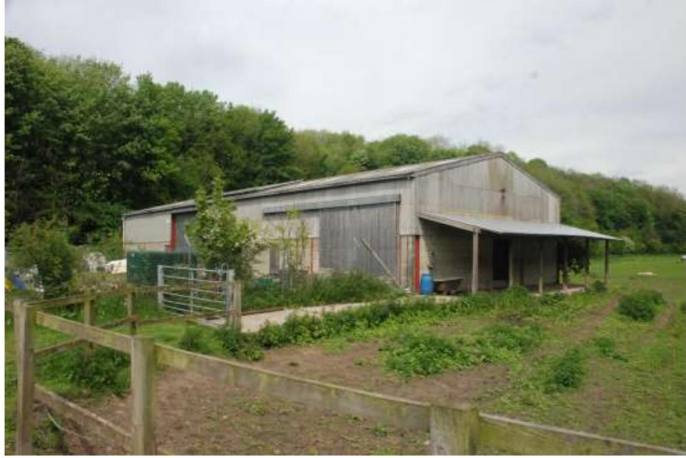
Existing farm building to remain