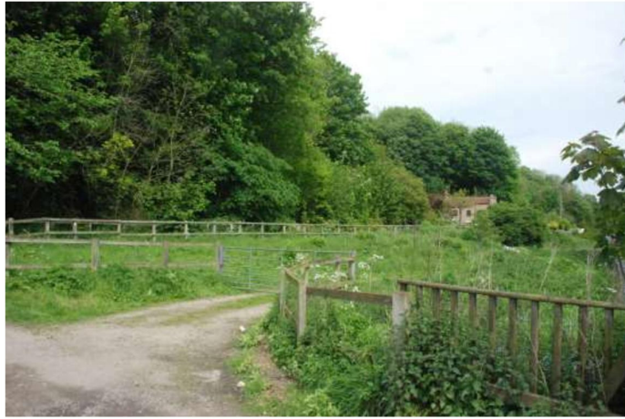
Existing lane to the west of the site leading to Rock Cottage