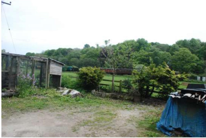
View onto the site from Rock Cottage