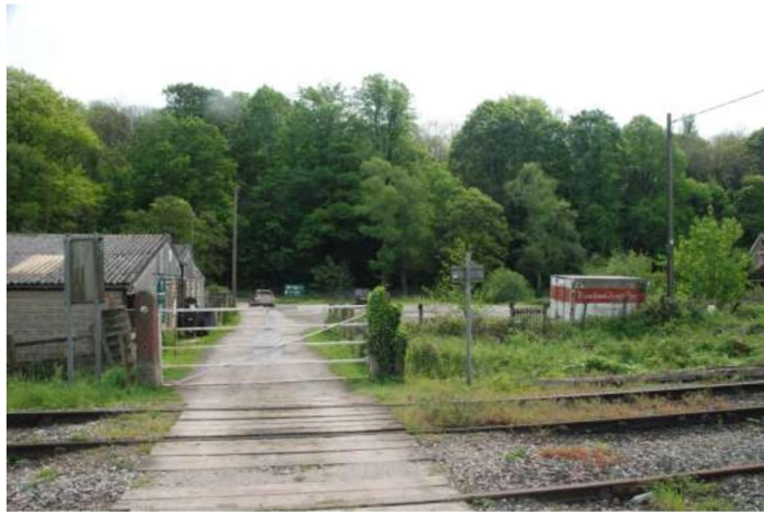
Level crossing, view looking east