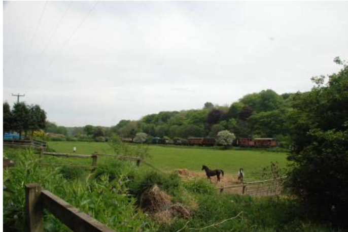
View onto the site from the south west corner