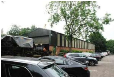
Current LNERCA shed

Small repair workshops have been built at Pickering Station, allowing overhauls to be undertaken. However, capacity is not sufficient to meet needs. A need for ten year-interval major overhauls on fifty vehicles suggests that around five carriages should be fully overhauled each year. In practice, about 1.5 complete overhauls is the most that can be achieved.