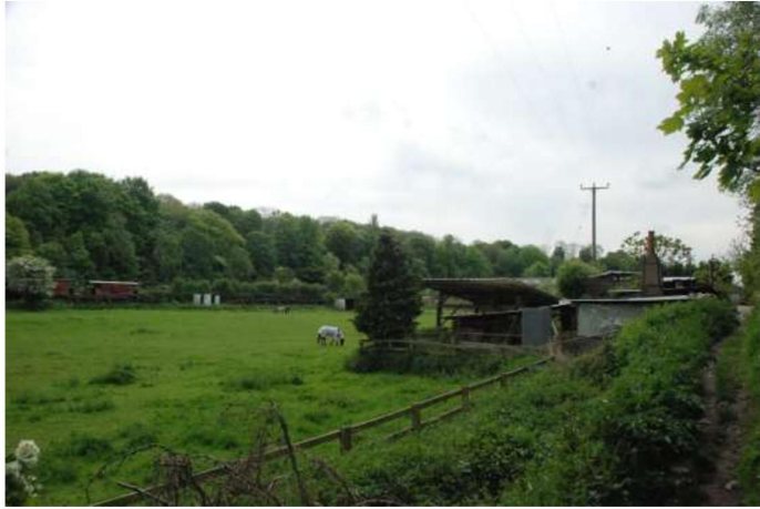
View of the site from the north of Rock Cottage