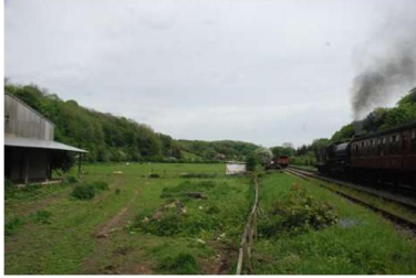
The view onto the proposed site from the lane

One superficially attractive site is that of the now largely disused trout farm tanks to the east of the railway between High Mill and New Bridge. However, this site is too narrow to be fully suitable and the owner is not prepared to make it available.