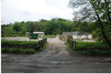
The current access from Undercliffe

The current level crossing, known as "Trout Farm User Worked Crossing" (UWC), requires authorised users to manually operate (open and close) the gates during the crossing process in conjunction with visually checking for any approaching trains.