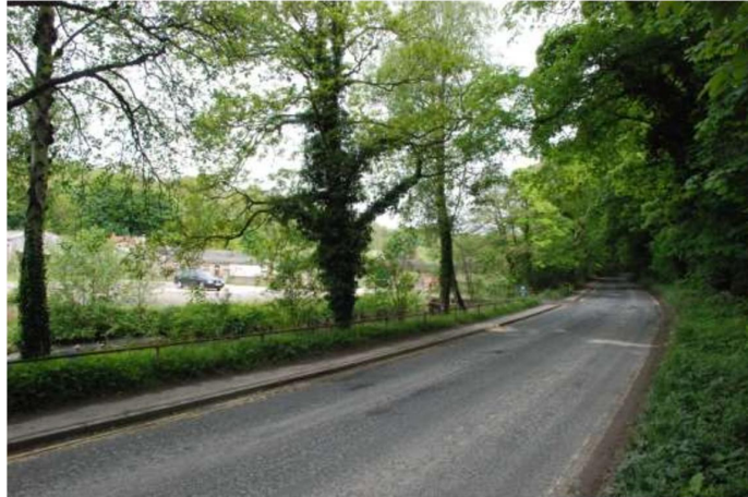
Entrance to the site from Underbank Looking north towards New Bridge