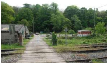
The current User Worked Level Crossing