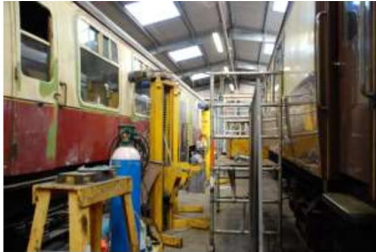
Internal view of the current NYMR shop