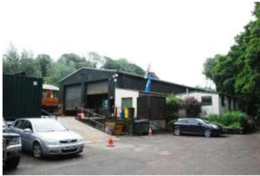
Current Repair Shed