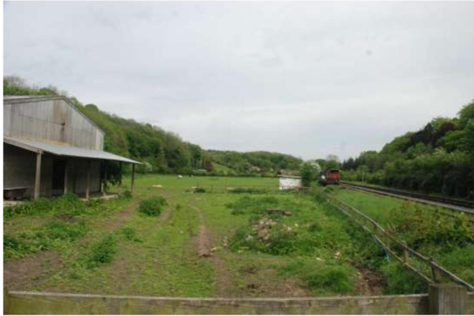
Entrance to the site, view looking north